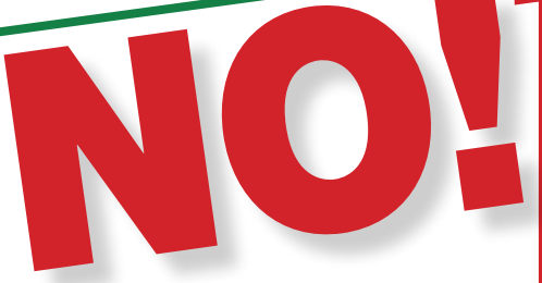
Put material in loose - Not in Bags