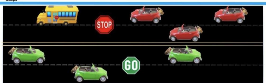
<u>Four-Lane Roadway Without a Median Separation:</u> When a school bus stops to unload passengers, only traffic traveling in the same direction as the bus must stop.