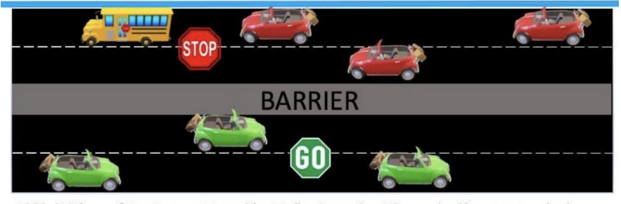
<u>Divided Highway of Four Lanes or More with a Median Separation:</u> When a school bus stops to unload passengers, only traffic traveling in the same direction as the bus must stop.